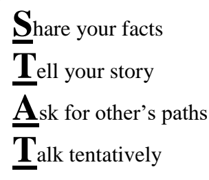
Figure 7-1. The Path to Action

• They utilize tools like the acronym STATE